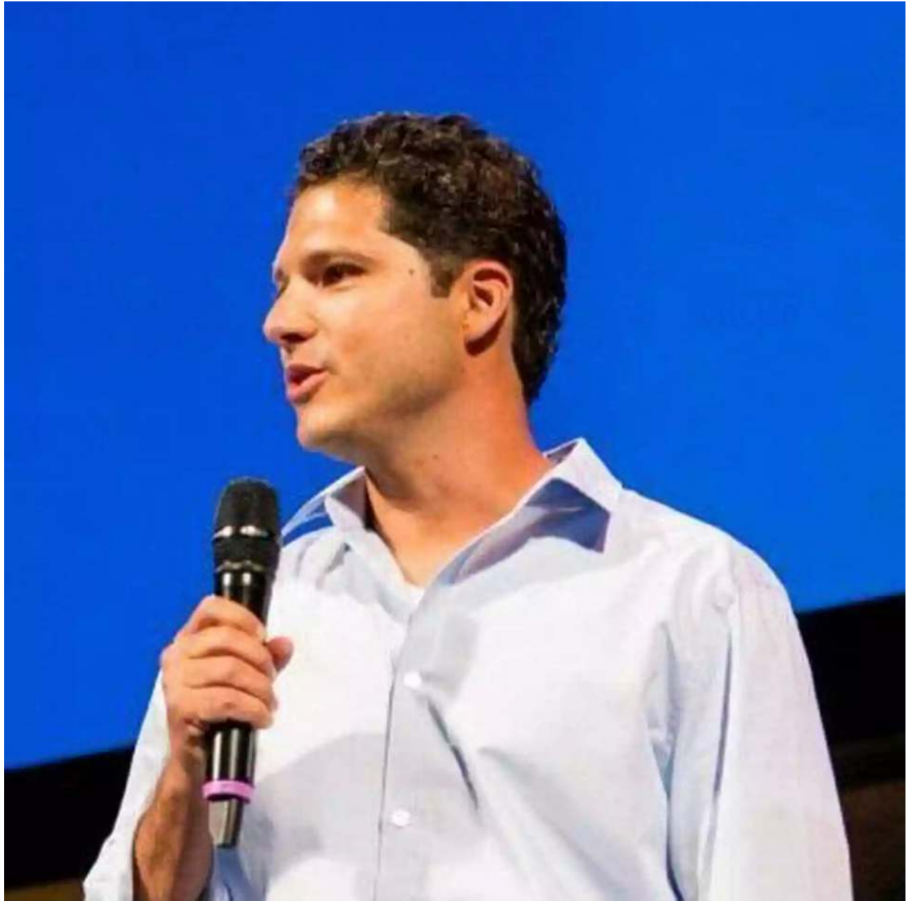
"The Catalyst Manifesto" cover picture