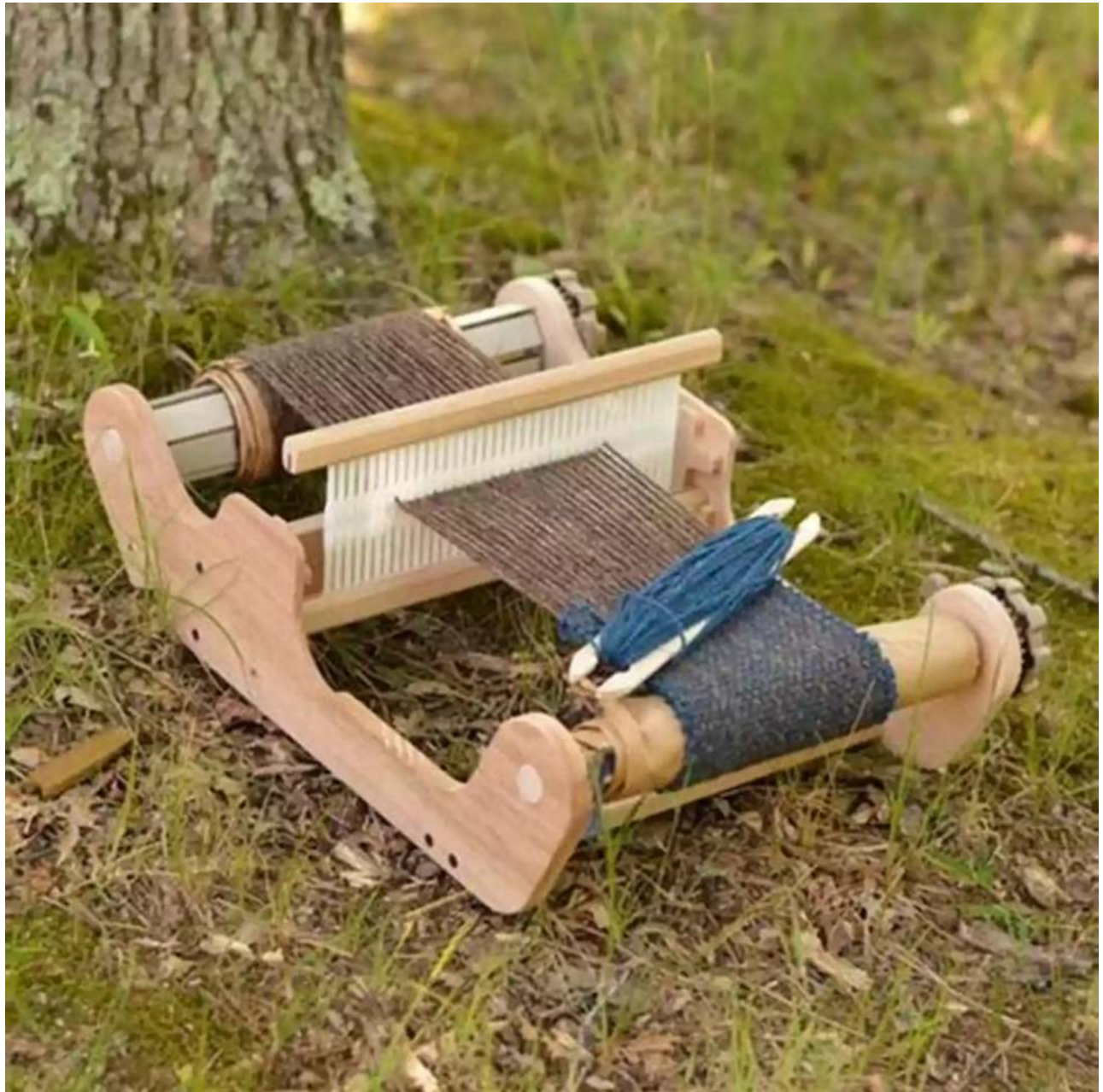
Pattern for the Easy Woven Jacket - A Simple Kimono Made on a Small Rigid Heddle Loom

through the creation of an easy woven jacket, specifically a simple kimono-style jacket, made on a small rigid heddle loom. With our step-by-step instructions and detailed pattern, you'll be able to create a unique and stylish garment that showcases your weaving skills.